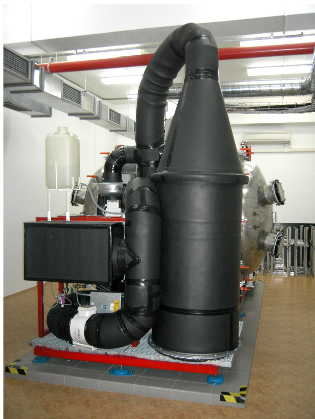
Fig. 1. The multifunctional vacuum chamber (view from the front side)