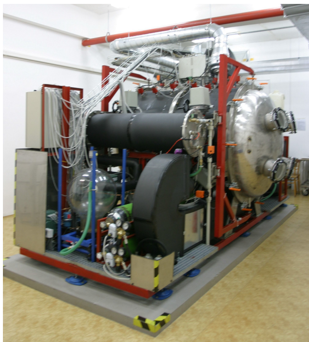
Fig. 2. The multifunctional vacuum chamber (view from the opposite side)

Good drying results depend on the accuracy of the drying parameters—above all on pressure, temperature, and relative humidity. We decided therefore to construct an additional, independent measuring system based on the usage of special sensors in a control (“signal”) book and in several other places inside the chamber, as well as a tensiometer for recognizing weight (water) loss. Data obtained from this system are accessible on the control PC and by internet transmission to dedicated remote PCs of key personnel. We monitor the humidity of the books after drying manu-