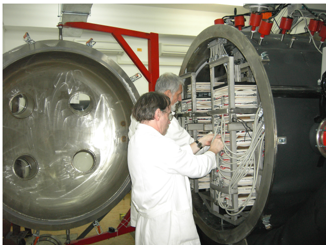
Fig. 3. Connecting cables to the heating tiles