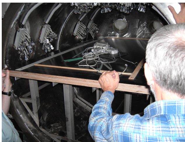
Fig. 6. Preparing the chamber for the drying of large-format documents

In the next phase, we would like to further exploit the chamber's properties. The combination of nitrogen, a vac-